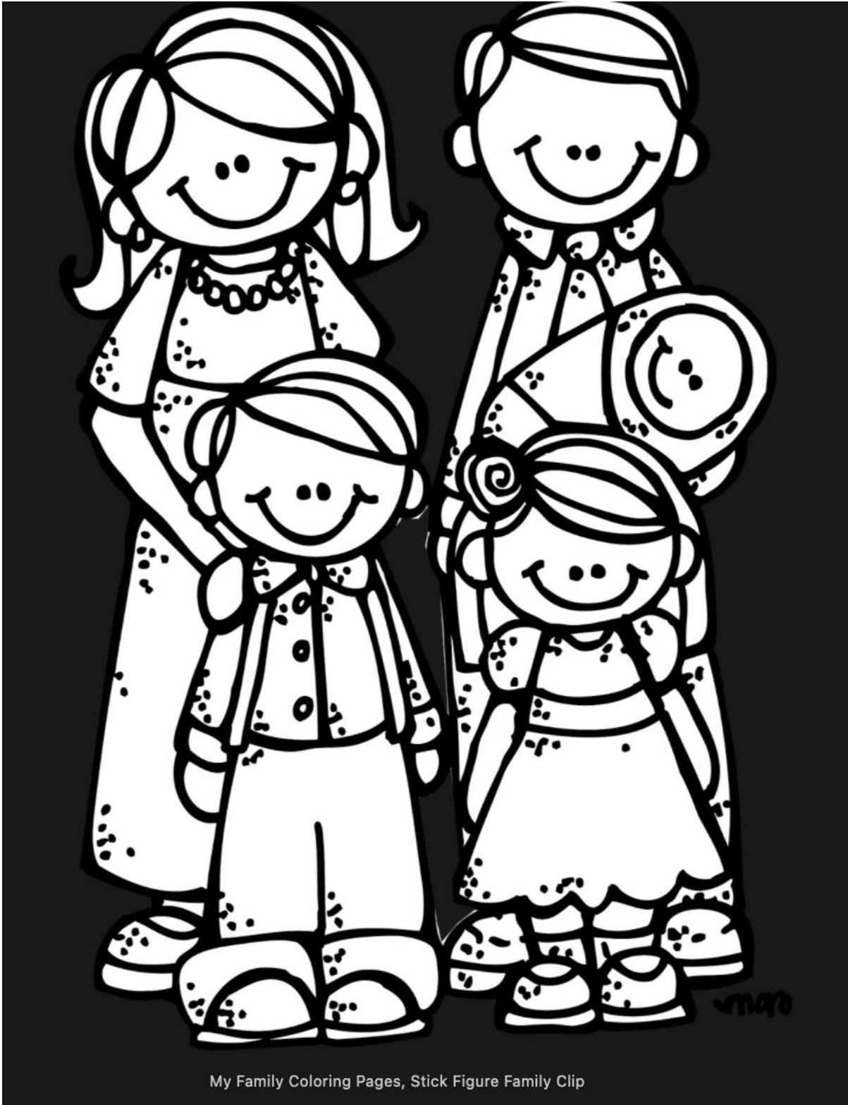
My Family Coloring Pages, Stick Figure Family Clip

4. Color the family members/ colorea el dibujo de los miembros de la familia